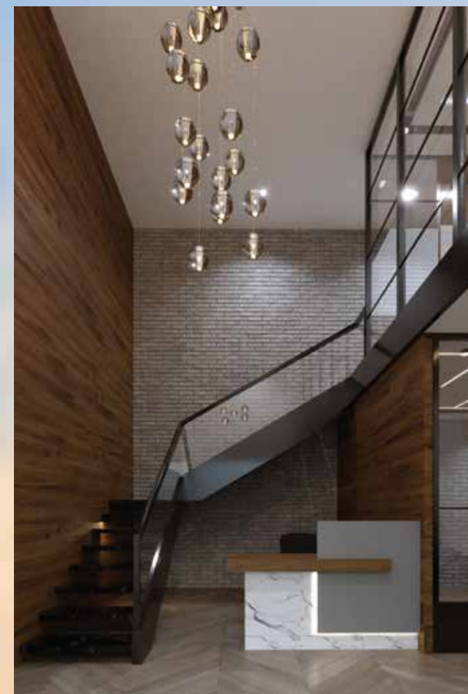
Kirloskarwadi (Civil + Interior Works)