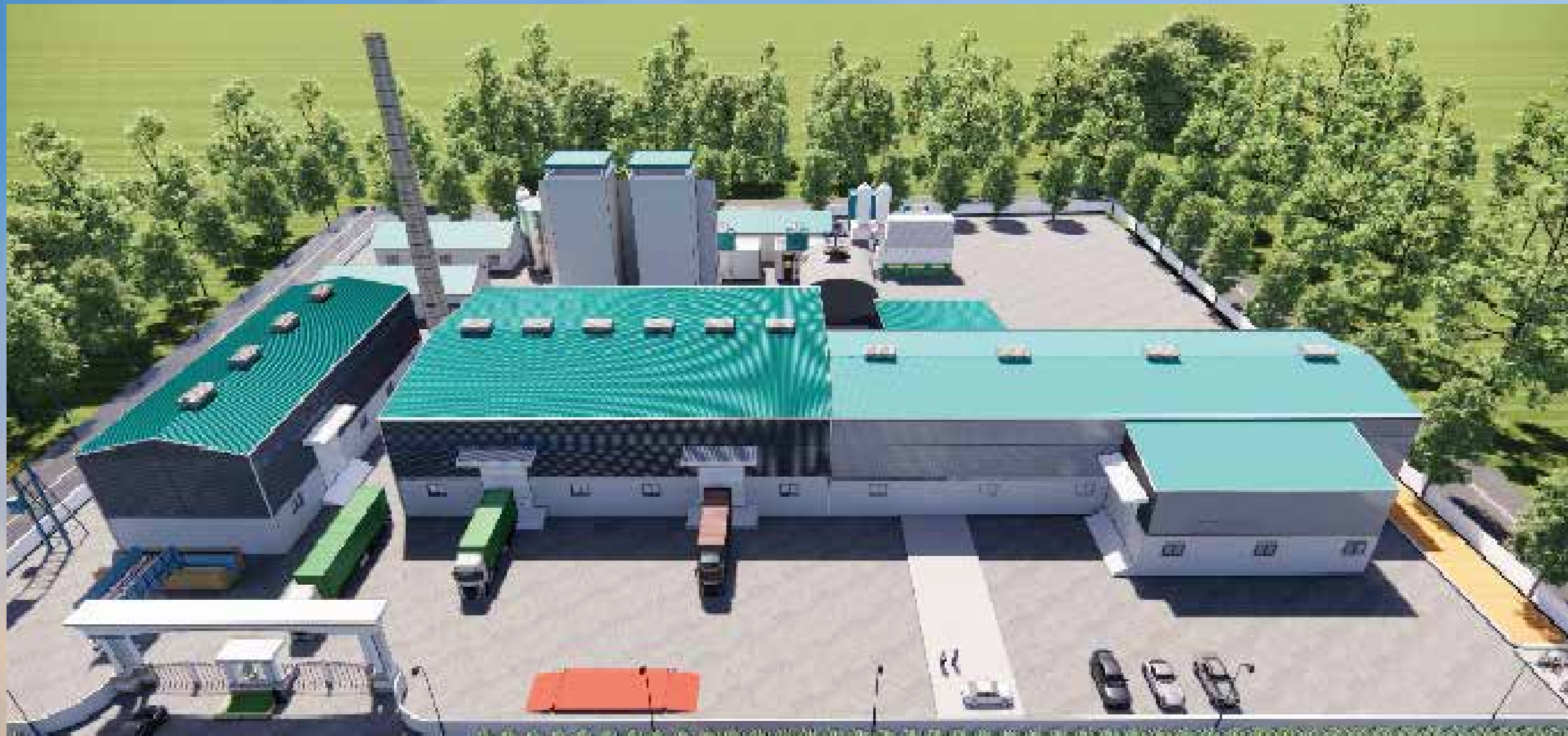
SANGRAM CANE AGRO, SUGAR FACTORY, BHILAWADI (PEB Work)